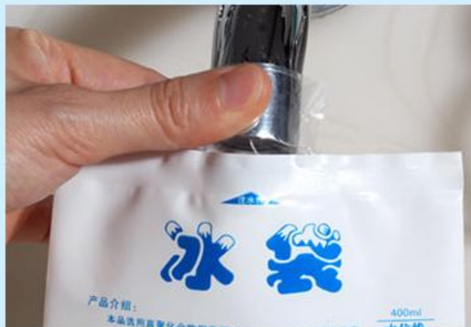
2 Fill water from hole