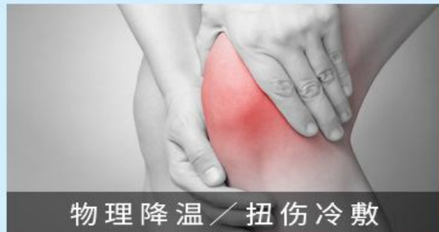
物理降温 / 扭伤冷敷