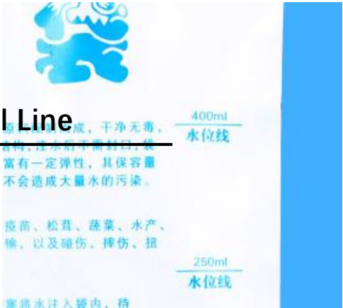
Water Level Line