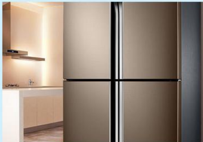
4 Frozen in refrigerator for 10-12 hours