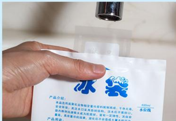
1 Open water injection seal