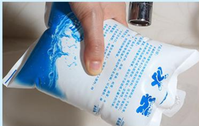
3 Gel reacting with water after some time